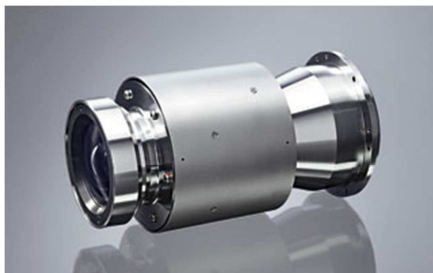
Lens for aerial cameras

SwissOptic AG – a company of the Berliner Glas Group – will present its optical components, assemblies and systems for innovative developments and projects in the dynamic geo sector at INTERGEO 2017. The company will display modules for optic measurement systems like tachymeters, theodolites, laser trackers and laser scanners, high accuracy measurement reflectors used in various applications, lenses and beam splitters for aerial cameras as well as interferometer lenses.